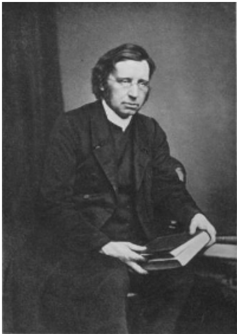
John Mason Neale (1818-1866) ( Ref. 4 )

John Mason Neale (1818-1866) was an English Anglican priest, scholar, and hymn writer ( Ref. 4 ). Neale is best known as a hymn writer and translator, having enriched English hymnody with many ancient and medieval hymns translated from Latin and Greek ( Ref. 4 ). Neale's best-known translations of hymns and Christmas songs include: "All Glory, Laud, and Honor," "Come, Ye Faithful, Raise the Strain," "Of the Father's Love Begotten," "Christ is Made the Sure Foundation," "Good Christian Men, Rejoice," and "Good King Wenceslas" ( Ref. 5 ).