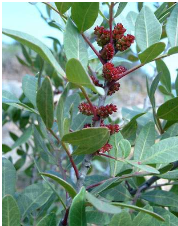
Mastic Tree – Ref. 3

Biblical Background. Gilead was a mountainous part of ancient Palestine, east of the Jordan River now corresponding to northwest Jordan ( Ref. 1 , Ref. 2 ). Gilead was known for its healing balm ( Jeremiah 46:11 ). We first see balm (mastic) mentioned in scripture as precious merchandise coming from Gilead ( Genesis 37:25 ). Joseph's father, Israel (Jacob), sent balm as a present to Joseph as lord of the land of Egypt ( Genesis 43:11 ).