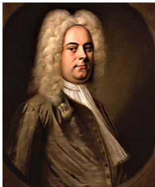
George Frideric Handel (1685-1759) (Ref. 5)

George Frideric Handel (1685-1759) was a German, later British, Baroque composer who spent the bulk of his career in London (Ref. 6). Handel composed his masterpiece oratorio, Messiah , in 1741 (Ref. 7). Lowell Mason's Antioch tune for "Joy to the World" borrows the first four notes from the chorus, "Lift Up Your Heads," in Handel's Messiah (Ref. 1).