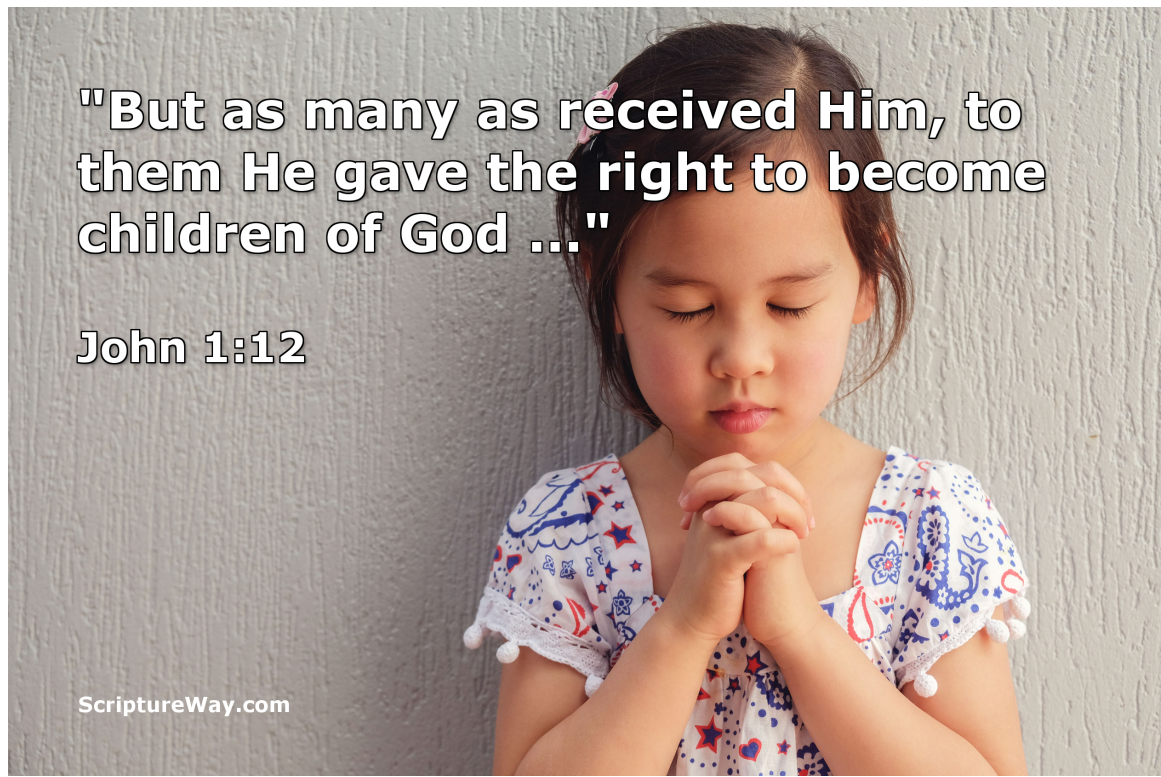
Becoming a Child of God - John 1:12

"But as many as received Him, to them He gave the right to become children of God, to those who believe in His name: who were born, not of blood, nor of the will of the flesh, nor of the will of man, but of God." (John 1:12-13 NKJV)