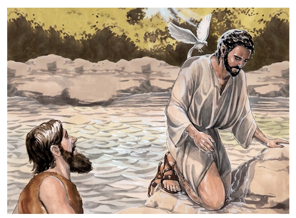
"You are My beloved Son" Used by Permission - Good News Productions International and College Press Publishing. Photo source: FreeBibleImages.org.

All of the scripture references below are from the New American Standard Bible translation on the Bible Gateway website (<u>Ref. 1</u>).