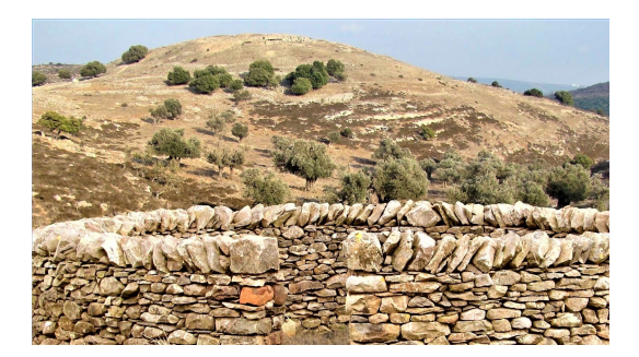
Permanent Sheepfold Enclosure -Holy Land.

A fold was a walled in, hedged, or fenced place for keeping and protecting sheep or other livestock (Ref. 11, Numbers 32:24 KJV). Jesus referred to such a sheepfold in John 10:1 (KJV). "Truly, truly, I say to you, he who does not enter the sheepfold by the door but climbs in by another way, that man is a thief and a robber." Jesus not only is the means of access to the fold; he also is the Shepherd who protects the sheep in the fold with his own body at the door. "I am the door. If anyone enters by me, he will be saved and will go in and out and find pasture" (John 10:9, Ref. 12).